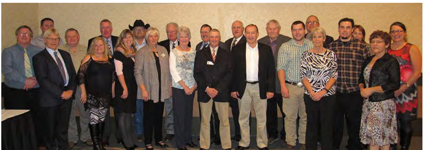
CCWG Directors and Staff attending the 98 th AGM Banquet at the Canad Inns, Winnipeg, MB, October 22 th , 2016