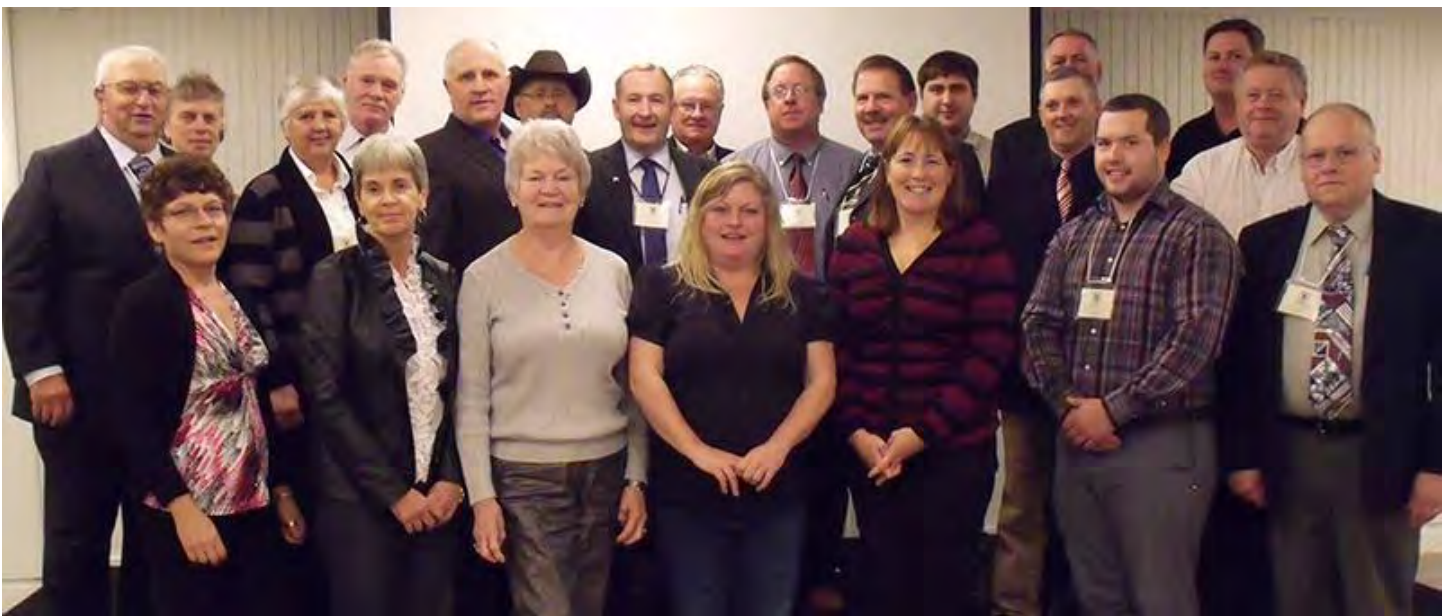
CCWG Directors and Staff attending the 96 th Annual General Meeting held in Lethbridge, Alberta on October 17 th -18 th 2014.