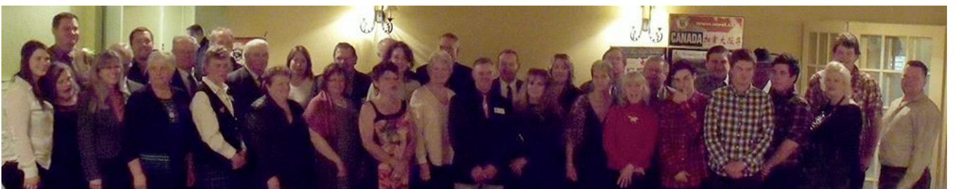
CCWG Directors and staff attending the 97 th AGM Banquet at the Canadian Golf and Country Club, October 24 th , 2015