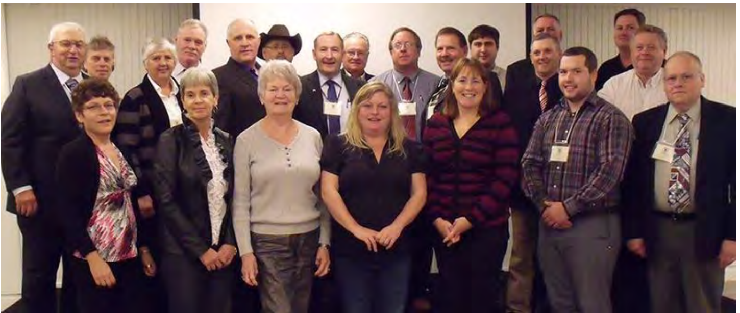
CCWG Directors and Staff attending the 96 th Annual General Meeting held in Lethbridge, Alberta on October 17 th -18 th 2014.