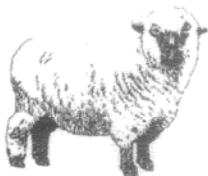
Medium Wool Breed Canada 3/8 Canada 1/4