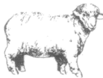
Fine Wool Breed Canada Fine Canada 1/2