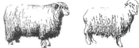
Long Wool Breed Coarse Wool Breed Canada Low 1/4 Canada Coarse